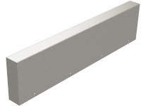
DC050.630 ISO VIEW OF ACTIVE DOOR SIDE