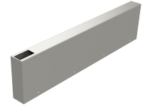
DC050.630 ISO VIEW OF INACTIVE DOOR SIDE