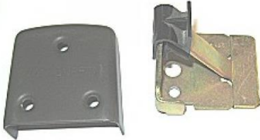
Replacement End Cap Bracket for LDH100