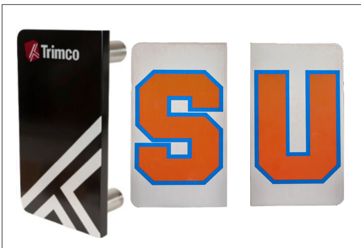
T-Print Custom Door Pulls