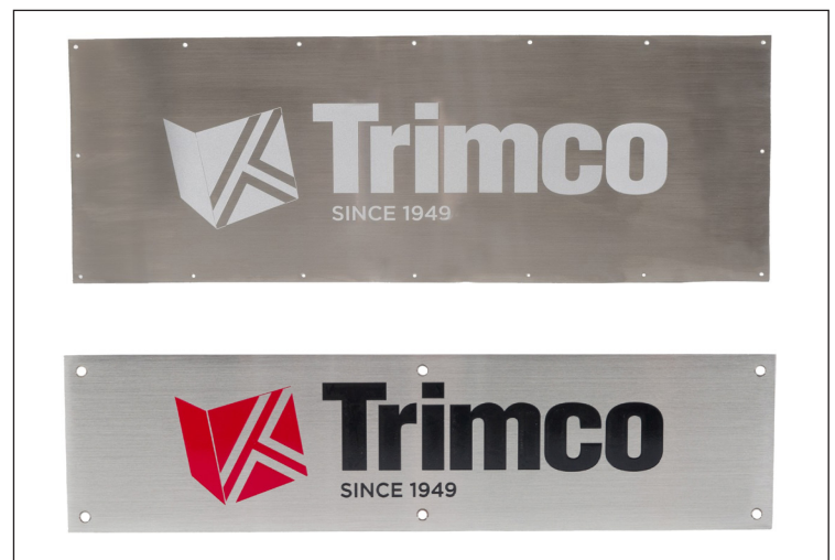
T-Etch Custom Push/Pull & Protection Plates