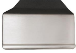
1096 No Cylinder