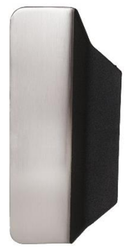
1097 No Cylinder