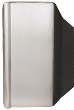
1096 No Cylinder