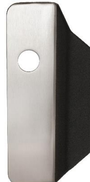
1097 w/ Cylinder