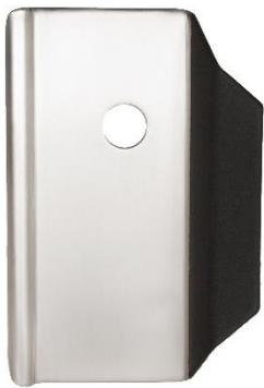
1096 w/ Cylinder

A standard in the industry, Trimco 1090 Series Anti-Vandal Pulls are engineered for the most demanding applications. Made from 1/8" type 316 stainless steel, bronze or brass these pulls are the ideal choice for protecting doors at schools, parks, public buildings and commercial buildings. Trimco's 1090 Series pulls do not have exposed handles or fasteners that can be tampered with and are available to mate different locksets and exit devices for both in swing and out swing doors.