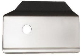
1096 w/ Cylinder