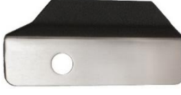
1097 w/ Cylinder